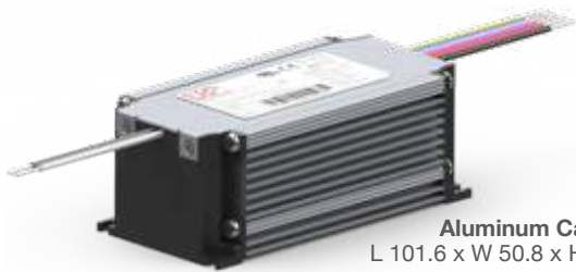
Aluminum Case L 101.6 x W 50.8 x H 38.5 mm (L 4 x W 2 x H 1.52 in)