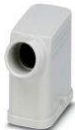
Sleeve housing for single locking engagement nose, lateral cable outlet, for HC-COM-K-KV-PG16 screw connections...

Please be informed that the data shown in this PDF Document is generated from our Online Catalog. Please find the complete data in the user's documentation. Our General Terms of Use for Downloads are valid ( http://download.phoenixcontact.com )