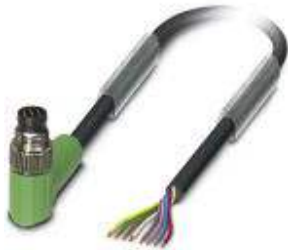
Sensor/Actuator cable, 8-position, PUR, Black RAL 9005, Plug angled M8, on Free cable end, Cable length: 5 m

Please be informed that the data shown in this PDF Document is generated from our Online Catalog. Please find the complete data in the user's documentation. Our General Terms of Use for Downloads are valid ( http://download.phoenixcontact.com )