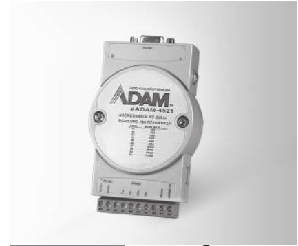
ADAM-4521 UL US LISTED ENEC CE RoHS COMPLIANT 2002/95/EC