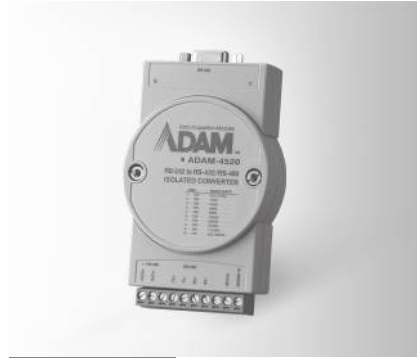
ADAM-4520 FCC CE RoHS COMPLIANT 2002/95/EC