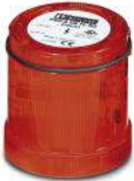
Flashing beacon element, 24 V DC, red, Xenon flash tube

Please be informed that the data shown in this PDF Document is generated from our Online Catalog. Please find the complete data in the user's documentation. Our General Terms of Use for Downloads are valid ( http://phoenixcontact.com/download )