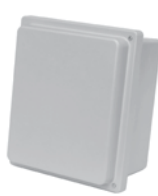
PJ Raised Lid Polyester Enclosure