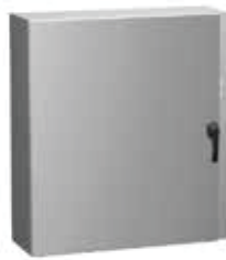
EN4DSC Single Door Disconnect Enclosure