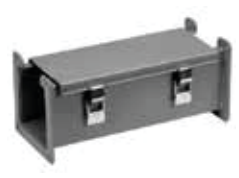
1485 Wiring Trough