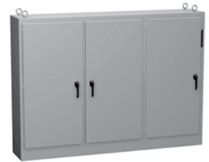
UHD Heavy Duty Disconnect Enclosures