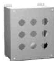
1437 Pushbutton Enclosure