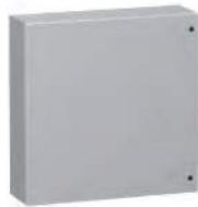
Eclipse Single Door Enclosure