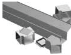
Type 1 Lay-In