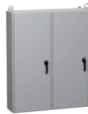
2UD Double Door Disconnect Enclosures