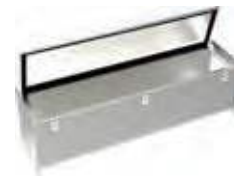
Type 4X Pull-Through