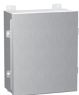
1414 NEMA 4X Stainless Steel Enclosure

Choosing the appropriate construction material is important, as the NEMA 4X rating is not a guarantee to corrosion resistance in all circumstances. Acids, alkalis and solvents react differently to different materials. With our wide and varied offering, Hammond can help guide you to the proper selection.