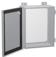
1414 NEMA 4 PH Enclosure

The Eclipse Junior Series, features a crisp, modern design. The EJ provides an efficient quarter turn latch system; an easy-ground galvanized back panel and an FTC style lip for superior protection against flowing liquids. The EJ is conveniently offered with a combined Type 12 and 4 rating.