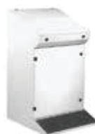
Series 2000 Console