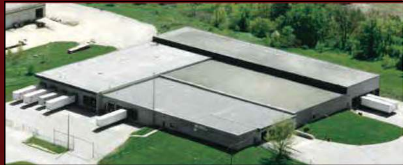
Hammond Distribution Center

We've committed our people and resources to ensuring you get exactly what you need, when you need it.