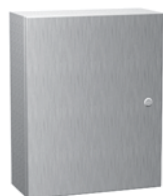
Eclipse Stainless Steel Enclosure