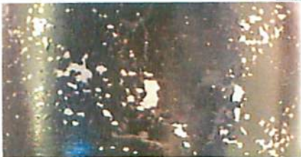
Shell body with UNACCEPTABLE Spalling of plating (10x)