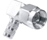
RPSMA Plug, Right Angle Abbreviation: "SB"