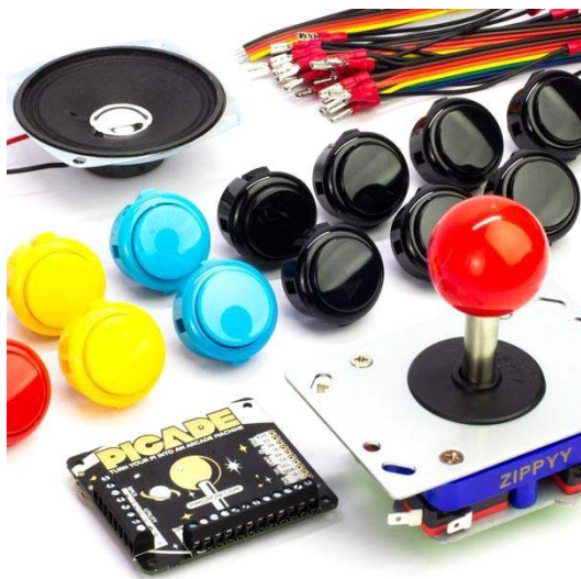
HAT & Parts Kit PIM252