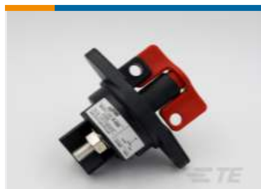
TE Part #K1156868 Battery Disconnecter 35-314-131-R-900