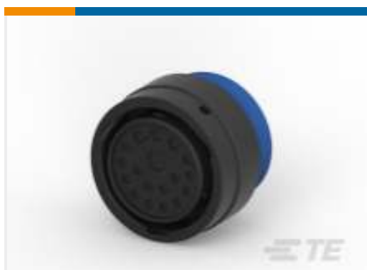
TE Part #YHDP26-24-18SEL024 PLG, 18P, BLK, E, WTHD, 8/12/16, S