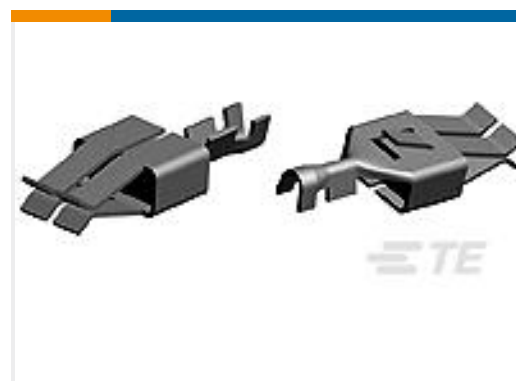
TE Part #927849-2 STC REC 6.3 Contact SRC Sn