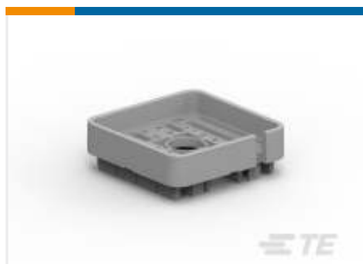
TE Part #WB-48SB DEUTSCH DRB Wedgelocks