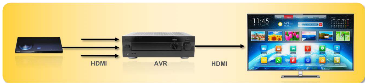
Figure 1: AVR Connection without eARC

eARC delivers forward compatibility by removing the audio device from the video path. With a conventional AVR system, both the audio and video flow from source devices through the AVR and onto the TV.