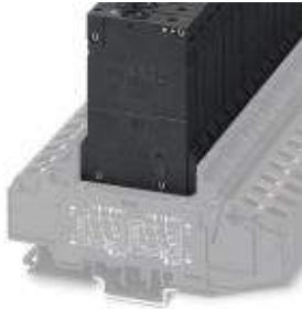
Thermomagnetic circuit breaker, 2-pos., normal blow, 1 N/O contact and 1 N/C contact

Please be informed that the data shown in this PDF Document is generated from our Online Catalog. Please find the complete data in the user's documentation. Our General Terms of Use for Downloads are valid ( http://phoenixcontact.com/download )