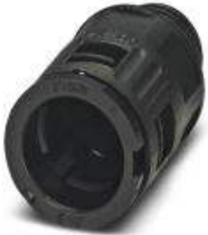
Cable gland, metric thread, IP66 protection, straight

Please be informed that the data shown in this PDF Document is generated from our Online Catalog. Please find the complete data in the user's documentation. Our General Terms of Use for Downloads are valid ( http://phoenixcontact.com/download )