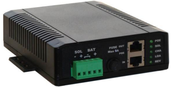
TP-SCPOE-2448-HP Charge Controller