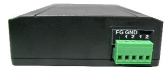
Back panel view