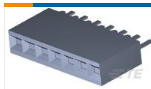
TE Part #534237-5 07 MODII VRT SR CE 100/115