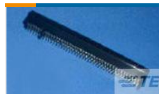
TE Part #8-1734774-0 PCI EXP 2.3L 64 POS BLK G/F