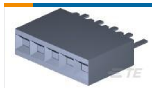
TE Part #534237-3 05 MODII VRT SR CE 100/115