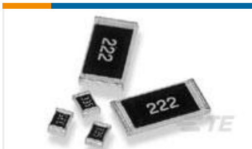
TE Part #8-1879501-7 CRGH2512 5% 3K9 2W