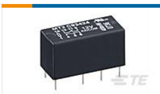
TE Part #4-1462000-5 C93420=MT Relay 200 mW 48 V