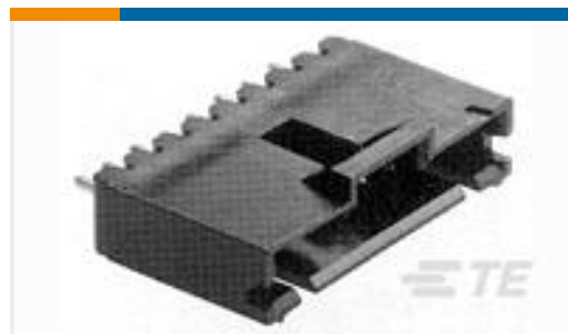
TE Part #6-104909-9 20 MTE HDR SRST LATCH W/HLDWN