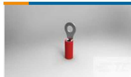
TE Part #2-36149-2 PIDG R 22-16 COM 22-18 MIL 6