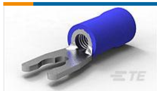
TE Part #52955-3 TERMINAL,PG SPR SPD 16-14 6