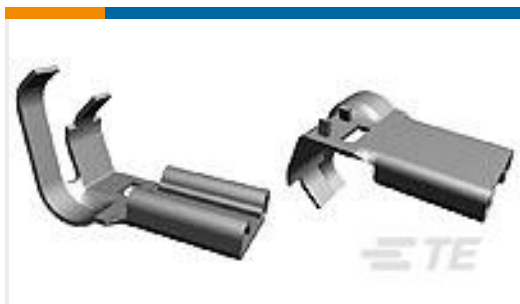
TE Part #42511-1 250 FASTON FLAG REC 18-12 AWG BR