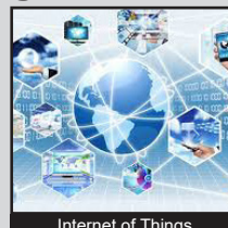
Internet of Things