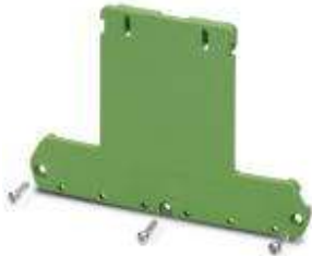
Side element, without foot, tall version, for 60 mm wide U-shaped cover.

Please be informed that the data shown in this PDF Document is generated from our Online Catalog. Please find the complete data in the user's documentation. Our General Terms of Use for Downloads are valid ( http://phoenixcontact.com/download )