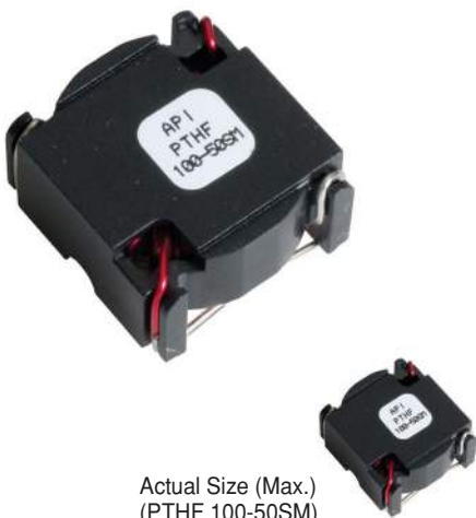
Actual Size (Max.) (PTHF 100-50SM)