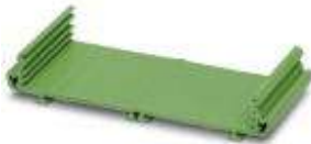
The illustration shows the variant UM 45-Profil CM

Drawn section panel mounting base, with a constructional width of 108 mm and a fixed length of 100 cm