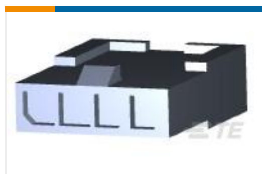
TE Part #1445049-4 FREE HANG SNGL ROW HSG 4 POS