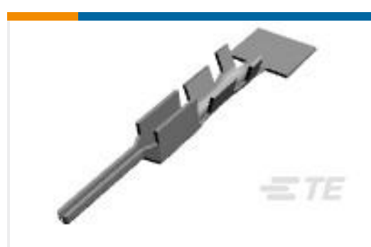
TE Part #1-794608-2 PIN CONT 20-24 30 GOLD STRIP