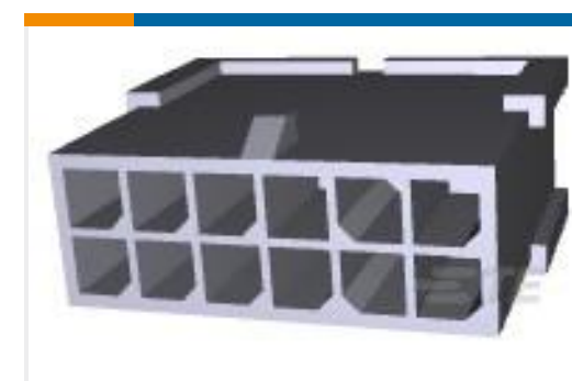
TE Part #1-794616-2 FREE HANG DBL ROW HSG 12 POS