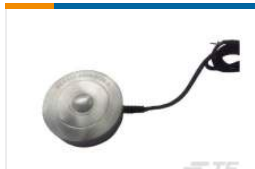
TE Part #FC2311-0000-0250-L FC23 MV 2FT CABLE 250L