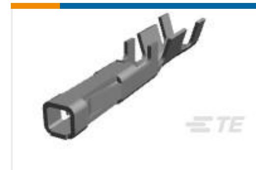
TE Part #1-794610-2 MICRO MNL RPT CNT, LS PC 30AU L