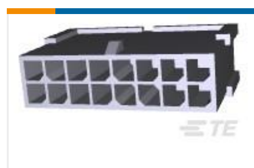
TE Part #1-794616-6 FREE HANG DBL ROW HSG 16 POS