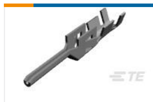
TE Part #1-794612-1 PIN CONT 20-24 15 GOLD L/P