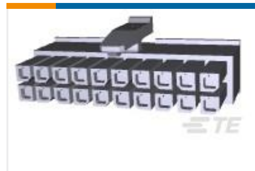
TE Part #2-794617-0 20POS, MICRO MNL, RCPT HSG