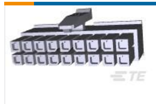
TE Part #1-794617-8 18POS, MICRO MNL, RCPT HSG