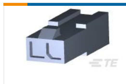
TE Part #1445049-2 FREE HANG SNGL ROW HSG 2 POS