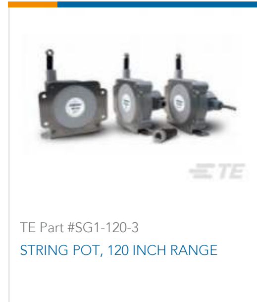
TE Part #SG1-120-3 STRING POT, 120 INCH RANGE