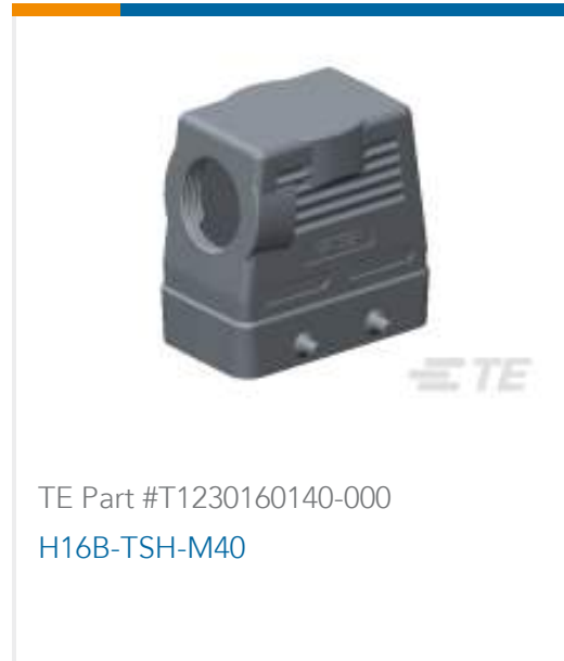
TE Part #T1230160140-000 H16B-TSH-M40