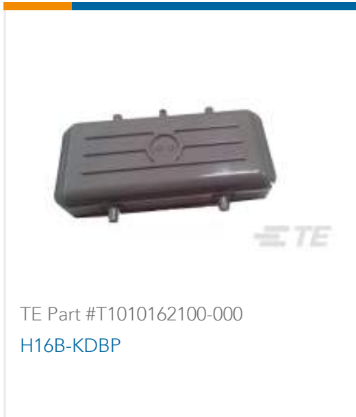
TE Part #T1010162100-000 H16B-KDBP