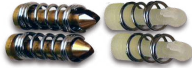
Push Pin Spring Kits