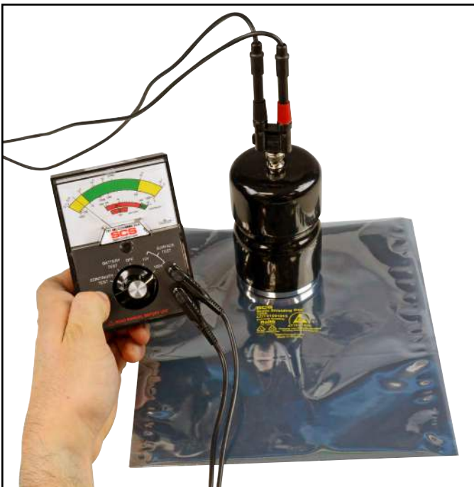
Figure 3. Using the Concentric Ring Probe with the SCS 701 Analog Surface Resistance Megohmmeter