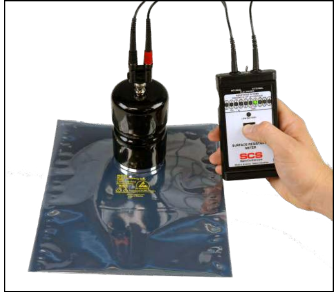
Figure 4. Using the Concentric Ring Probe with the SCS SRMETER2 Surface Resistance Meter