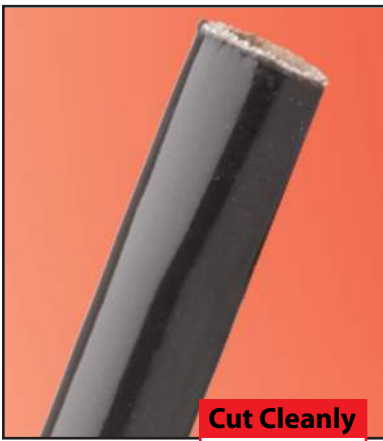
Cut Cleanly Scissors

SF sleeving is rated to 392°F. (Class H), is abrasion resistant, and maintains it's flexibility in low temperature environments. It is available in a very wide range of sizes, and is ideal for use in appliance assemblies, wire harnesses, transformer leads, power supplies, motor coil and heater leads.