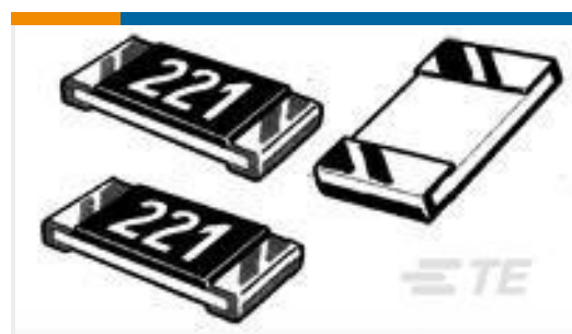
TE Part #7-2176070-1 3521 8K2 1% 2W