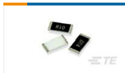
TE Part #4-1622825-2 RL73K 3A R12 5% 4K RL