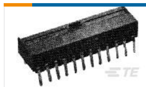
TE Part #281336-1 MODU II SGL ROW 12P REC.ASSY, TIN, HMT