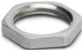
Flat nut with M16 thread

Please be informed that the data shown in this PDF Document is generated from our Online Catalog. Please find the complete data in the user's documentation. Our General Terms of Use for Downloads are valid ( http://download.phoenixcontact.com )