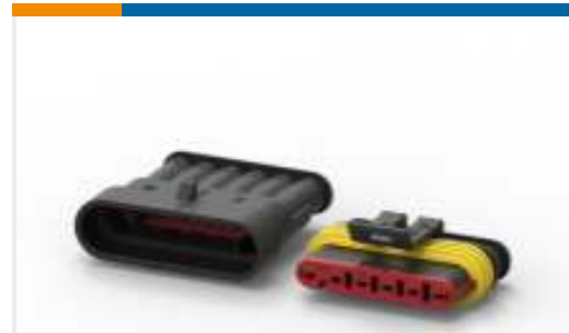
TE Part #282104-1 AMP SUPERSEAL 1.5MM, CONNECTOR HOUSING