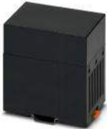
Electronic module, for PCB insertion, with a high 35 mm covering hood

Please be informed that the data shown in this PDF Document is generated from our Online Catalog. Please find the complete data in the user's documentation. Our General Terms of Use for Downloads are valid ( http://phoenixcontact.com/download )