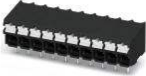
The illustration shows the 10-position version