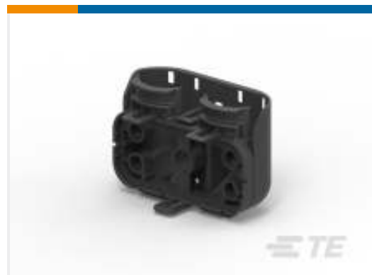
TE Part #0528-004-3805 BKSHL, 38P, BLK, PLG, RA