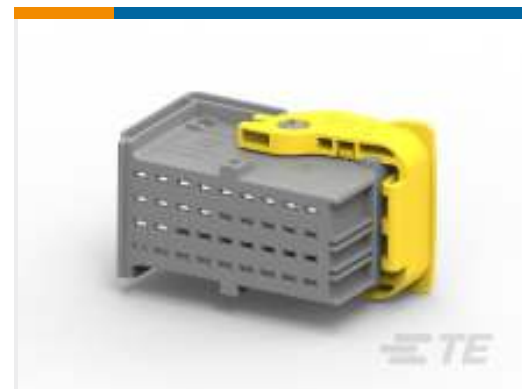
TE Part #1-1718485-5 CARRIER FOR RECEPT. INSERTS 36 POS