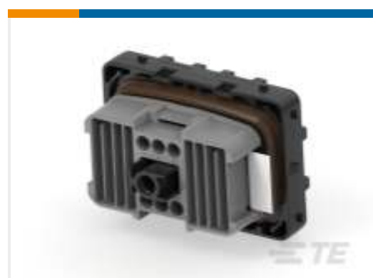
TE Part #DRCP24-86PA REC, 86P, BLK, 12/20, A