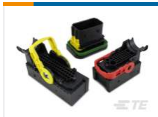
TE Part #2-2112162-1 LEAVYSEAL Housings