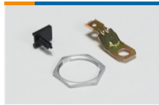
Other Automotive Connector Accessories(11)