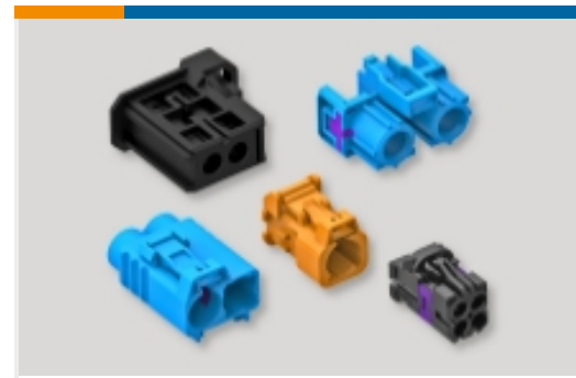
Data Connectivity Housings(3)