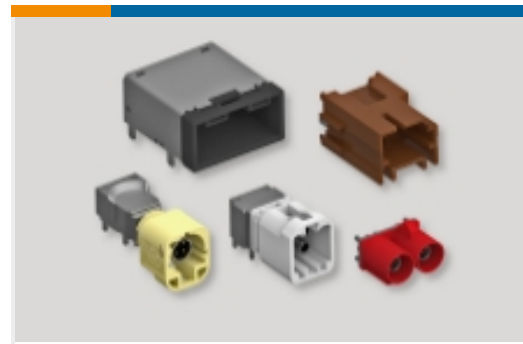
Data Connectivity Headers(2)