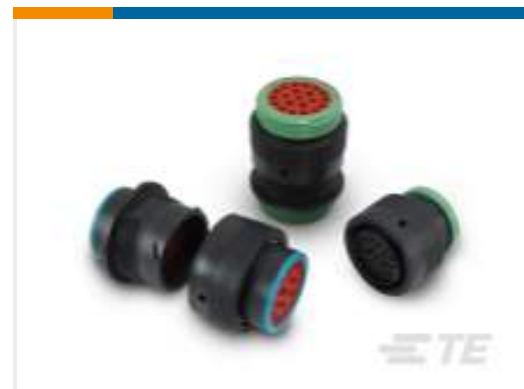
TE Part #HDP26-24-7SN-CL18 DEUTSCH HDP20 Housings