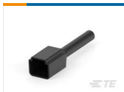
TE Part #DTP2P-BT-BK BOOT, 2P, REC, ST, BLK