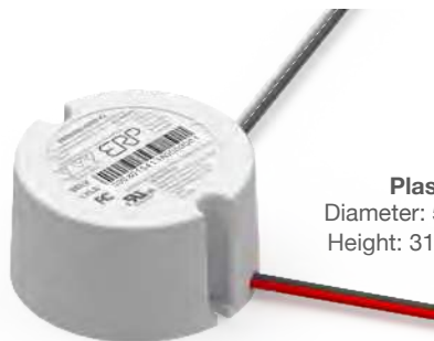
Plastic Case Diameter: 58 mm (2.28 in) Height: 31.7 mm (1.25 in)