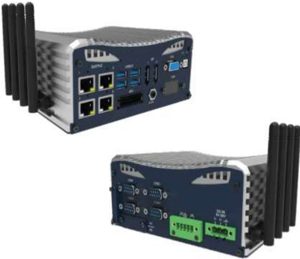
Models shown with Optional Antennas Kit

6th Generation Intel® Core™ U Series Processor Fanless Box Computer, 4x RJ45 GbE/PoE