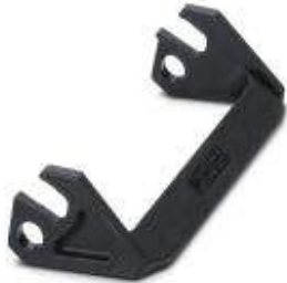
Replacement single locking latch for HEAVYCON EVO housing type B24, PA

Please be informed that the data shown in this PDF Document is generated from our Online Catalog. Please find the complete data in the user's documentation. Our General Terms of Use for Downloads are valid ( http://phoenixcontact.com/download )