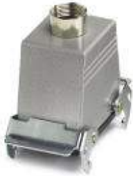
HEAVYCON sleeve housing D50, with double locking latch, height 76 mm, with support 1x M32, straight conductor exit

Please be informed that the data shown in this PDF Document is generated from our Online Catalog. Please find the complete data in the user's documentation. Our General Terms of Use for Downloads are valid ( http://download.phoenixcontact.com )