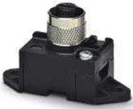
AS-Interface distributor with IP67 protection for one flat-ribbon conductor, with a straight, A-coded, 2-pos. M12 socket

Please be informed that the data shown in this PDF Document is generated from our Online Catalog. Please find the complete data in the user's documentation. Our General Terms of Use for Downloads are valid ( http://phoenixcontact.com/download )