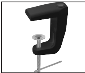
Heavy-Duty Mounting Clamp