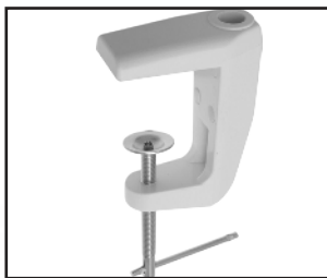
Heavy-Duty Mounting Clamp