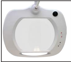
7.5 Inch x 6.2 inch/ 3 Diopter Lens 1.75x Magnification