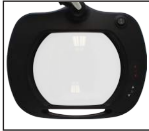
7.5 Inch x 6.2 inch / 5 Diopter Lens 2.25x Magnification