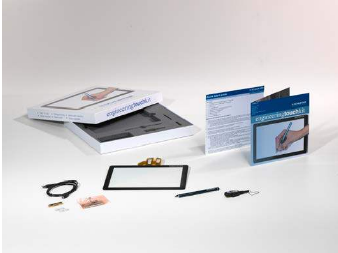
Contents of the Design-In-Kit