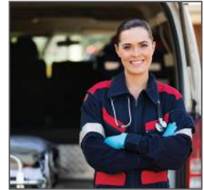
Emergency Medical Service