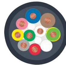
PUR/PVC black [PUR]