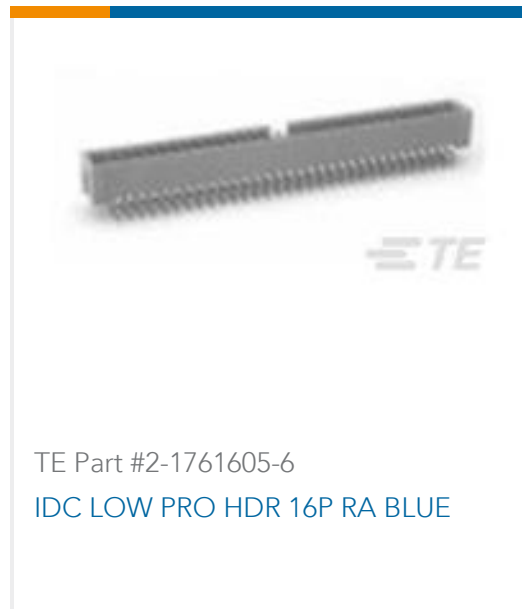
TE Part #2-1761605-6 IDC LOW PRO HDR 16P RA BLUE