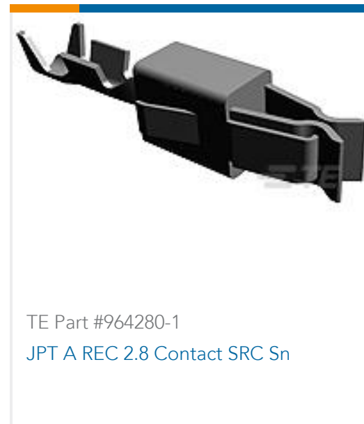
TE Part #964280-1 JPT A REC 2.8 Contact SRC Sn