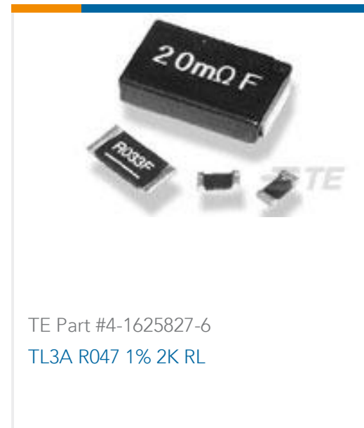
TE Part #4-1625827-6 TL3A R047 1% 2K RL