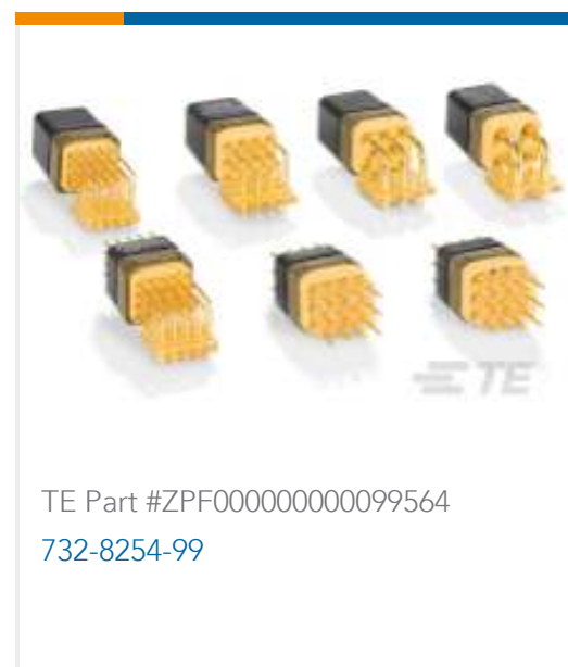
TE Part #ZPF000000000099564 732-8254-99