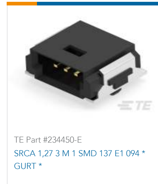
TE Part #234450-E SRCA 1,27 3 M 1 SMD 137 E1 094 * GURT *