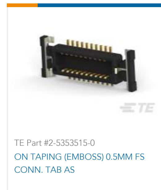
TE Part #2-5353515-0 ON TAPING (EMBOSS) 0.5MM FS CONN. TAB AS