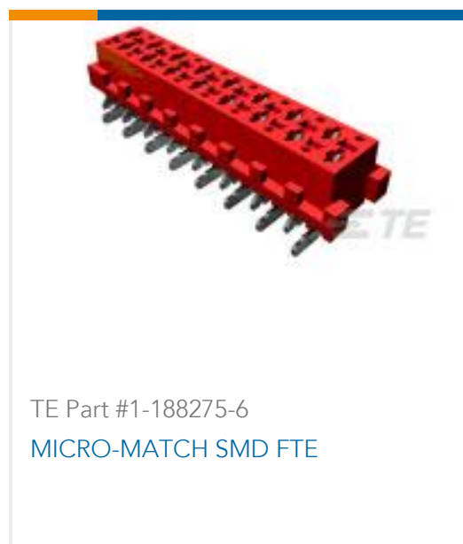
TE Part #1-188275-6 MICRO-MATCH SMD FTE