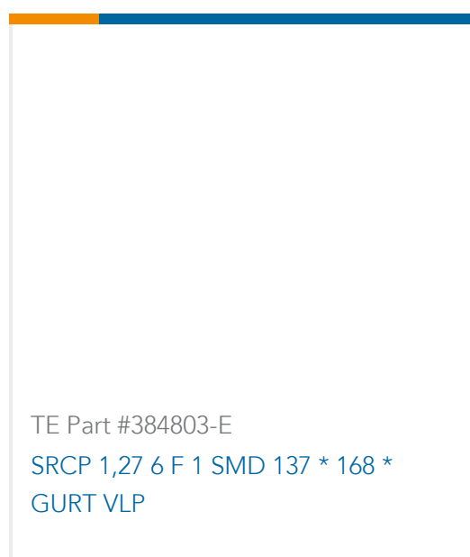
TE Part #384803-E SRCP 1,27 6 F 1 SMD 137 * 168 * GURT VLP