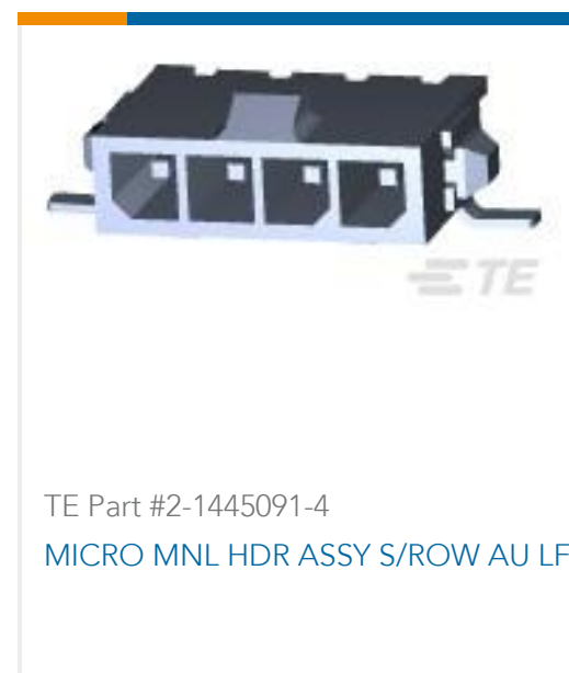
TE Part #2-1445091-4 MICRO MNL HDR ASSY S/ROW AU LF