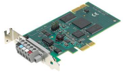
DN4 DeviceNet PCIe Card Series 112113