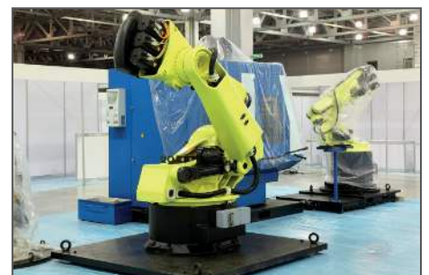
Automotive Robot Controller