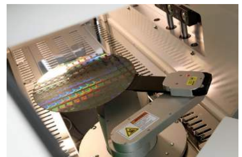
Semiconductor Wafer Assembly