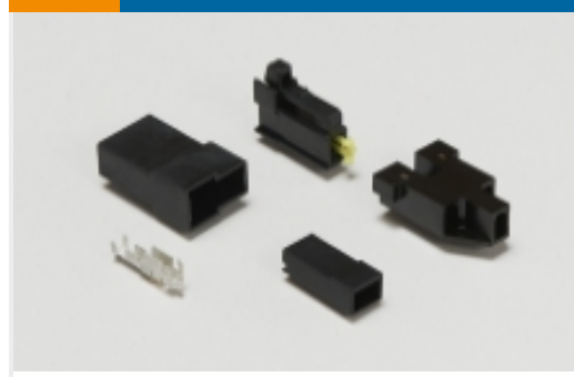
Magnet Wire Terminals(196)