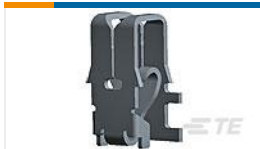
TE Part #964339-1 MAG MATE KONT. MKII