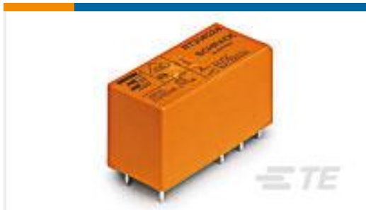
TE Part #2-1393243-4 RTE25524