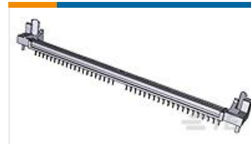
TE Part #5822138-4 80 ME .050 L/P AU M/L PB-FREE