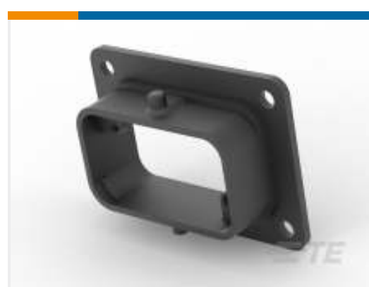
TE Part #2295892-1 SHROUD PLASTIC