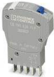
Thermomagnetic device circuit breaker, 1-pos., tripping characteristic F1 (fast-blow), 1 PDT contact, plug for base element.

Please be informed that the data shown in this PDF Document is generated from our Online Catalog. Please find the complete data in the user's documentation. Our General Terms of Use for Downloads are valid ( http://download.phoenixcontact.com )