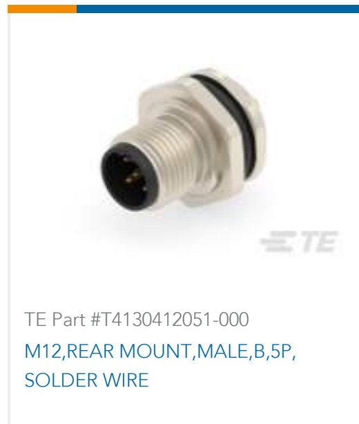
TE Part #T4130412051-000 M12,REAR MOUNT,MALE,B,5P, SOLDER WIRE