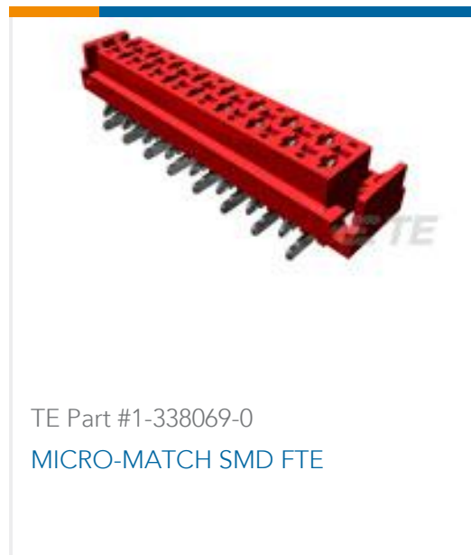
TE Part #1-338069-0 MICRO-MATCH SMD FTE