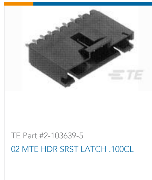
TE Part #2-103639-5 02 MTE HDR SRST LATCH .100CL