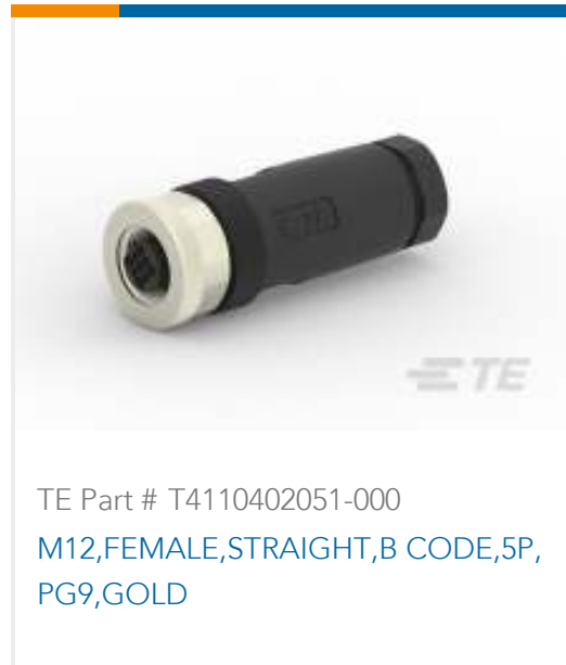
TE Part # T4110402051-000 M12,FEMALE,STRAIGHT,B CODE,5P, PG9,GOLD