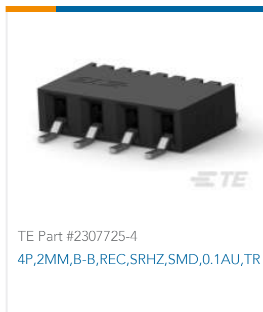
TE Part #2307725-4 4P,2MM,B-B,REC,SRHZ,SMD,0.1AU,TR