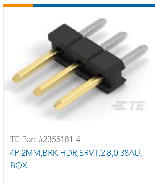
TE Part #2355181-4 4P,2MM,BRK HDR,SRVT,2.8,0.38AU, BOX