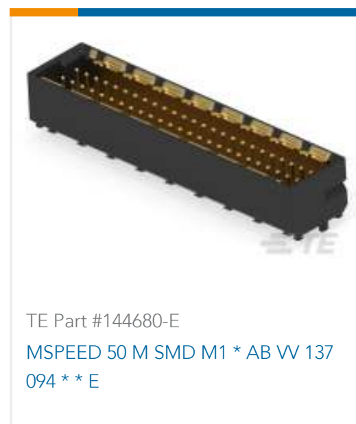
TE Part #144680-E MSPEED 50 M SMD M1 * AB VV 137 094 * * E