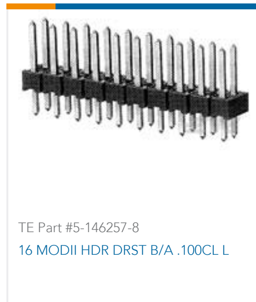
TE Part #5-146257-8 16 MODII HDR DRST B/A .100CL L