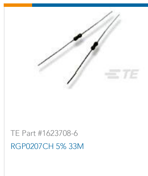
TE Part #1623708-6 RGP0207CH 5% 33M