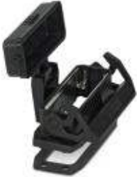
HEAVYCON EVO panel mounting base, plastic, D25, with single locking latch, flat gasket, and protective cover

Please be informed that the data shown in this PDF Document is generated from our Online Catalog. Please find the complete data in the user's documentation. Our General Terms of Use for Downloads are valid ( http://phoenixcontact.com/download )