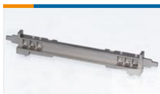
TE Part #2057592-2 CFP Guide Rail