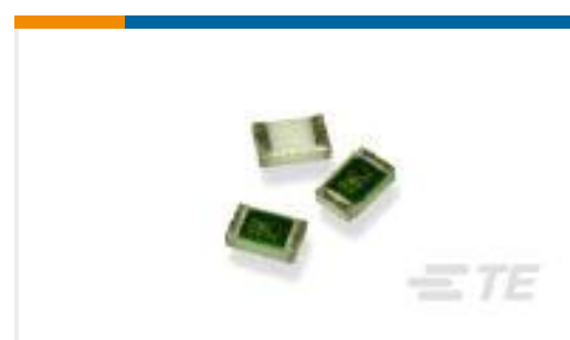
TE Part #5-1879215-3 CPF 0402 15K8 0.1% 25PPM 1K RL