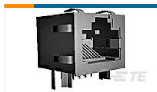
TE Part #6364288-1 INV MJ,1X1,PNL GRD,RJ11BLOCK,BLK