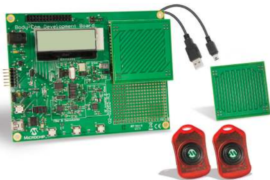
BodyCom™ Development Kit (Part # DM160213)