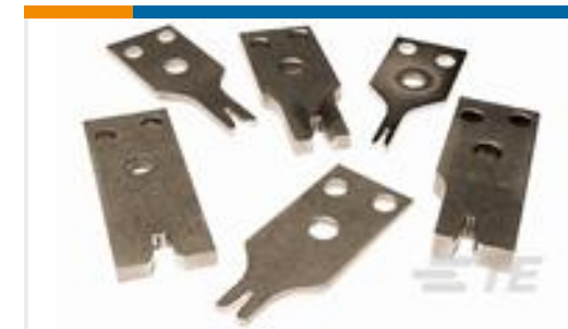
TE Part #1-234156-1 CRIMPER,WIRE SPECIAL