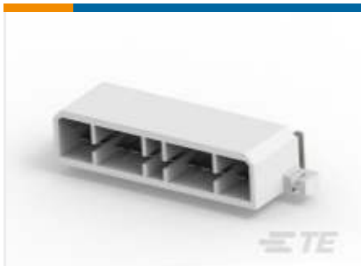
TE Part #2290317-1 MIC 21POS. CAP HOUSING ASSY