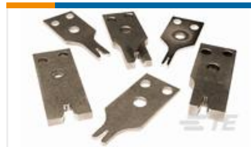
TE Part #2-409282-9 INSULATION CRIMPER