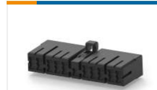
TE Part #2290314-1 MIC MARK2 21POS. PLUG HOUSING.