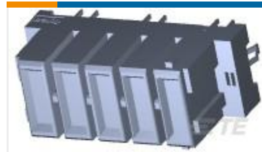
TE Part #5-1747147-3 DZ5200 V-REC ASSY 3P 10.16MM PITCH