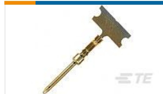
TE Part #1658544-3 CONT,PIN,PLATED,20DF,STRIP,#22